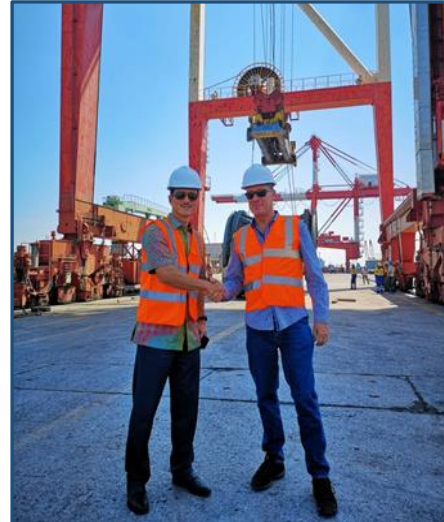
Figure 2: Unloading of the first two smelters at Tenau Port, Kupang