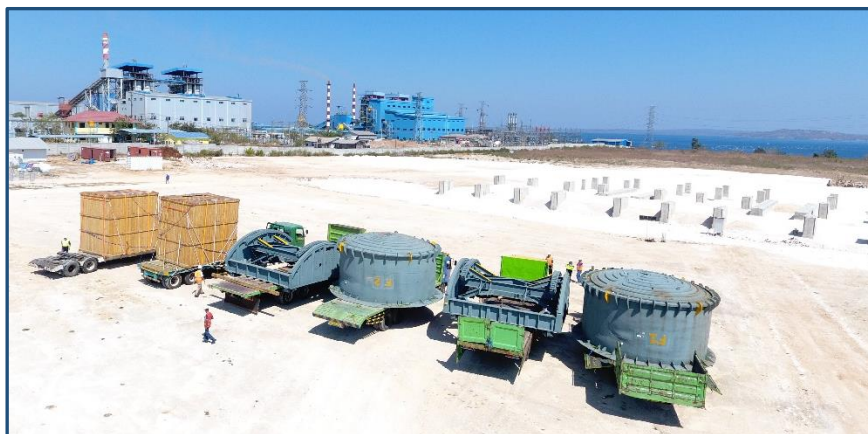
Figure 1: Arrival of the Smelters at Bolok Industrial Estate, Kupang showing the Power Station in the background

During the quarter, the two smelters were shipped from Durban, arriving at Tenau Port, Kupang on July 23, 2018. After clearing customs, the smelters were transported to the Smelting Hub site located at the Bolok Industrial Estate.